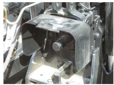
Figure 1: Square masterguard Figure 2: Tapered masterguard

The masterguard must be able to withstand a force of 1200N, (1200N = 122kg = 270lb = 19 stone) so ensure the steel plate is adequate. Steel sheets such as "tin" (thin gal steel), is not strong enough. Make sure that you copy one that has similar PTO diameter and torque rating, as the requirements are slightly different depending on this. It is obviously easier to bend up a square guard such as in Figure 1 below, rather than the tapered guard type in Figure 2. It is worth looking into incorporating a pre-sprung hinge arrangement such as in Figure 3, if some implements require greater access.