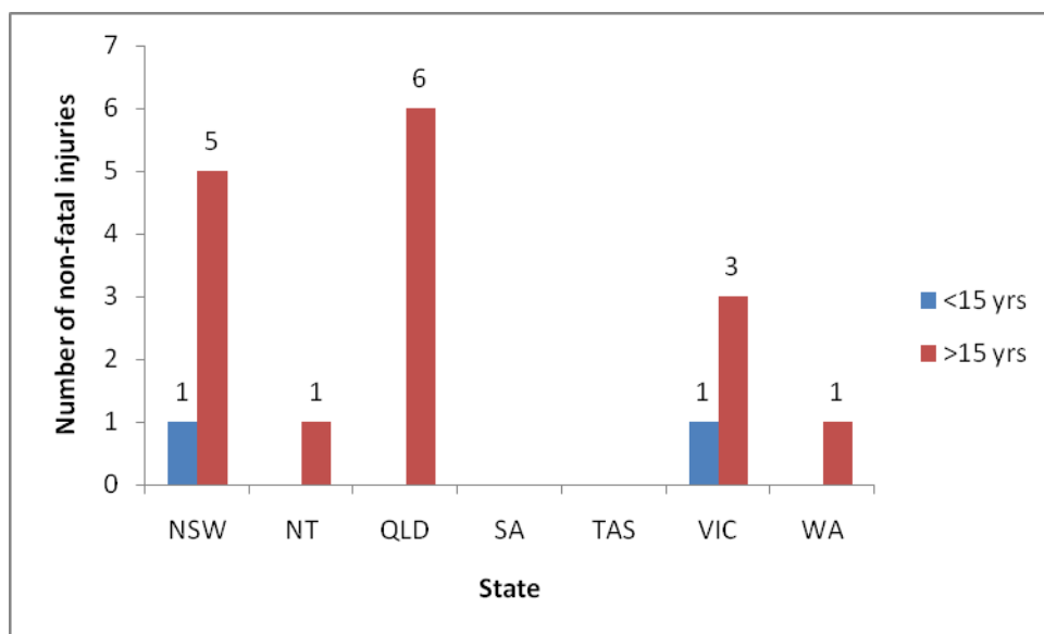
Figure 2: On-farm non-fatal injury events reported in Australian print media, Jan-March 2014.