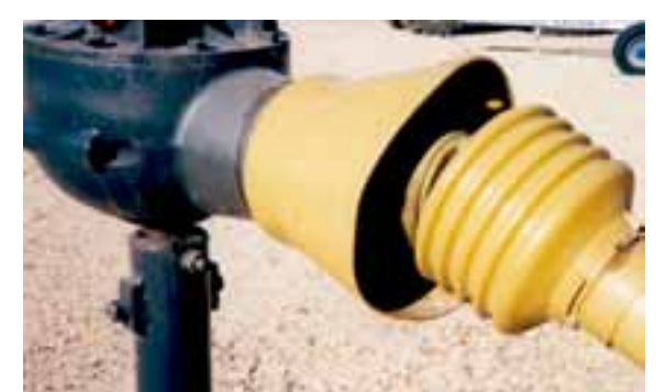
A different model posthole digger. The same problem of exposed universal joint is evident.

While modern machines must comply with design standards relating to guarding of machine parts, it appears from the evidence that these standards do not remove the risk factor. This may be due to failure on the part of the operator to refit guards after maintenance or repair, or to failure to replace guards that lose effect owing to damage or normal wear and tear. Operators have commented that PTO guards have a short life span under normal working conditions. Australian Standard AS1121-1983, Guards for Agricultural Tractor PTO Drives, Paragraph 1.5, note, "Where guards are constructed from plastics material, the plastics should be a type that is known to be resistant to deterioration due to the effects of exposure to sunlight or to high ambient temperatures." The vague nature of this note provides no assistance to designers or manufacturers, and operator comments suggest that materials in common use certainly are not resistant to deterioration.