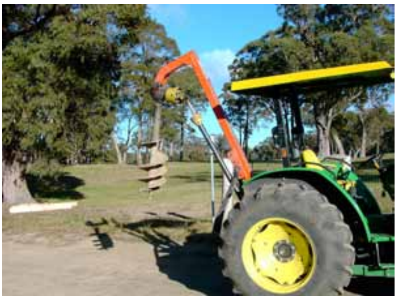
Linkage mounted posthole digger

The most common design consists of a single beam mounted on the three point linkage, with the digger gearbox suspended from the outer end. Drive is via a shaft connected to the tractor PTO or a hydraulic motor. Some manufacturers use a twin beam frame as an alternative to the simpler single beam design.