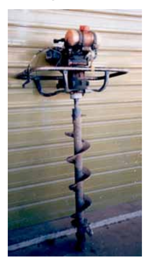
Portable engine-driven posthole digger

Small, engine driven, augers are manufactured for manual operation, requiring one or two operators. The design consists of a chainsaw type engine mounted on the top of the auger shaft via a reduction gearbox, with handles for the operators.