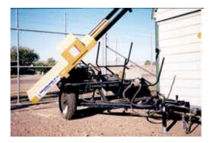
Trailer mounted post driver. Operation is hydraulic, operating from the tractor remote hydraulic lines.

Post drivers consist of a weight (usually 200 to 300 kilograms), which is raised and dropped on the top of the post to drive it into the ground. A small auger for drilling a pilot hole may be fitted.