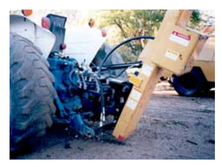
Three-point-linkage mounted post driver.

Post drivers consist of a weight (usually 200 to 300 kilograms), which is raised and dropped on the top of the post to drive it into the ground. A small auger for drilling a pilot hole may be fitted.