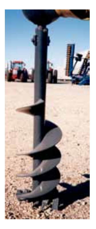
Typical posthole digger auger

The most serious areas of risk with posthole diggers are the PTO shaft and the auger, providing other parts of the machine have the manufacturers guards fitted. Problems with the PTO drive shaft and auger arise from hair or loose clothing becoming caught on the shaft, and pulled in by the rotation. It only requires a small piece of mud or rust adhering to the shaft, or a nick in the shaft, to catch and pull hair or clothing.